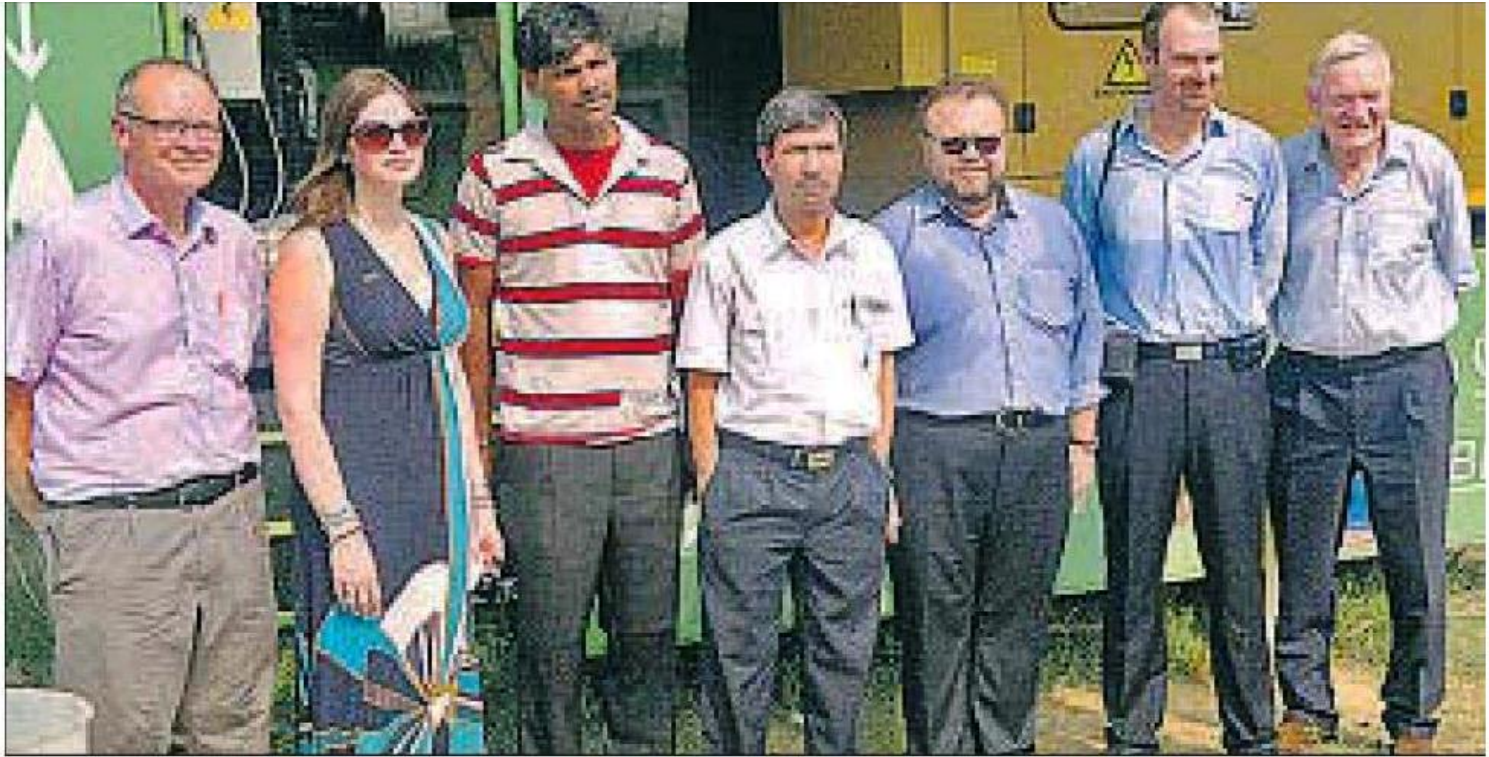
■ Officials from Aston University, UK, and British Deputy High Commission, Chandigarh, during launch of a renewable energy project at Khwaspura village near Rupnagar on Tuesday.